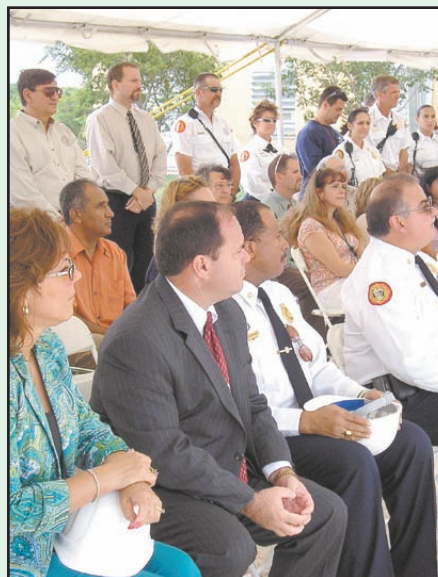
County and City officials and personnel from Miami-Dade Fire Rescue attended the ceremony.

On Thursday, October 5, Miami-Dade Fire Rescue held a groundbreaking ceremony for Fire Station #65 — the East Homestead Station.