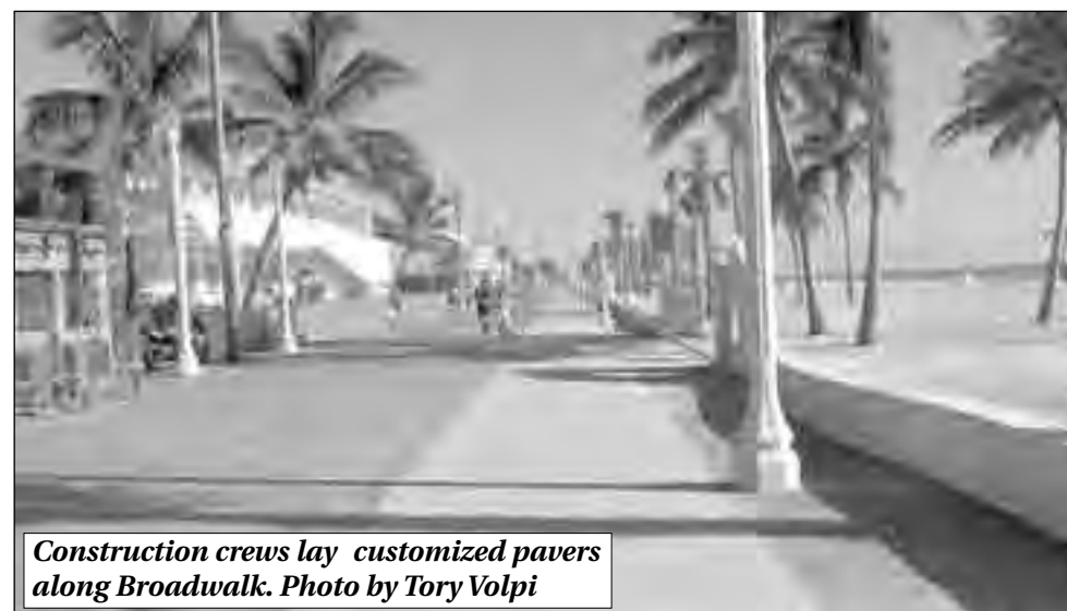
Construction crews lay customized pavers along Boardwalk.

For more information on beach improvements, call the Hollywood Beach CRA at (954) 924-2980 or visit www.hollywoodbeachcra.org .