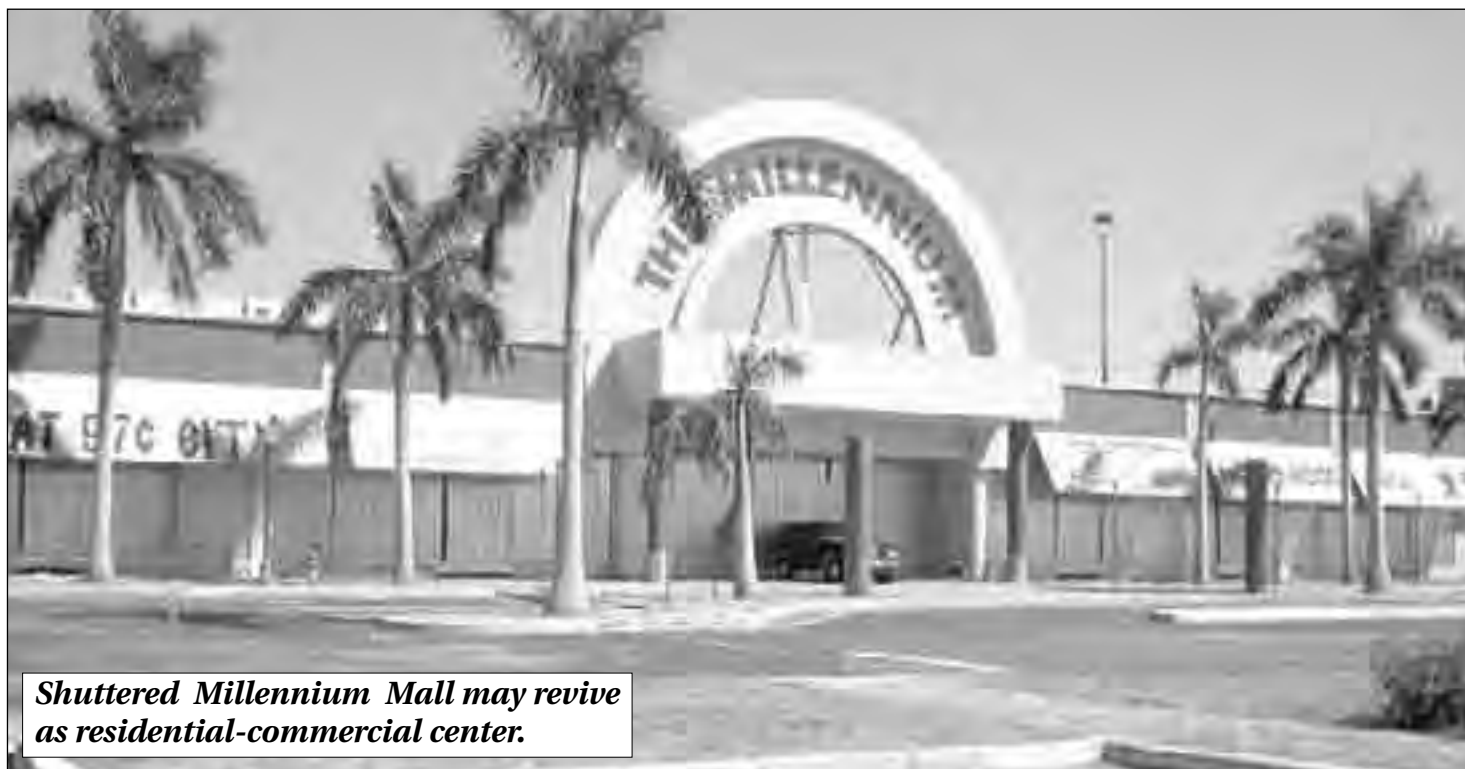
Shuttered Millennium Mall may revive as residential-commercial center.

"It won't look like a strip mall. It'll look