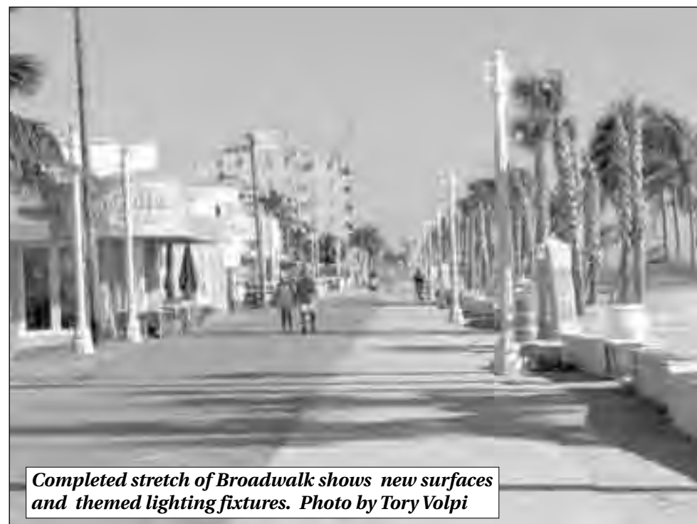
Completed stretch of Boardwalk shows new surfaces and themed lighting fixtures.

block pilot program, between Grant and Cleveland streets, will start in about five months, said Moe Anuar, senior project manager for Hollywood's Department of Design & Construction Management. Proposed improvements include decorative pavers on streets and sidewalks, and the creation of gateways, landscaped plazas and vista points incorporating water features, sculptures and/or central focal points.