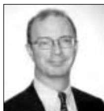
J. Thomas Cookson Chair