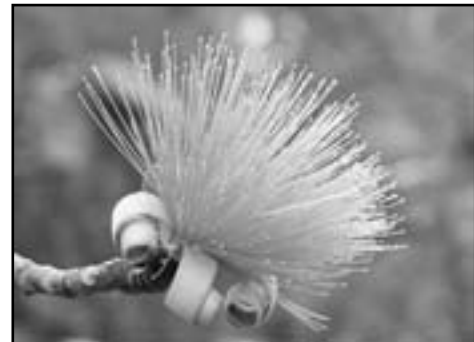
"Something Pink" by Paula Turk