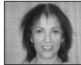
Before visiting The Wig Outlet

ins are welcome, but Blanca advises that it's always a good idea to call ahead. Store hours are 10 a.m. to 5 p.m. Monday through Friday. After-hour sessions are available by appointment. The Wig Outlet is conveniently located three-quarters of a mile west of I-95 and one mile east of 441. For more information, call (954) 983-9447.